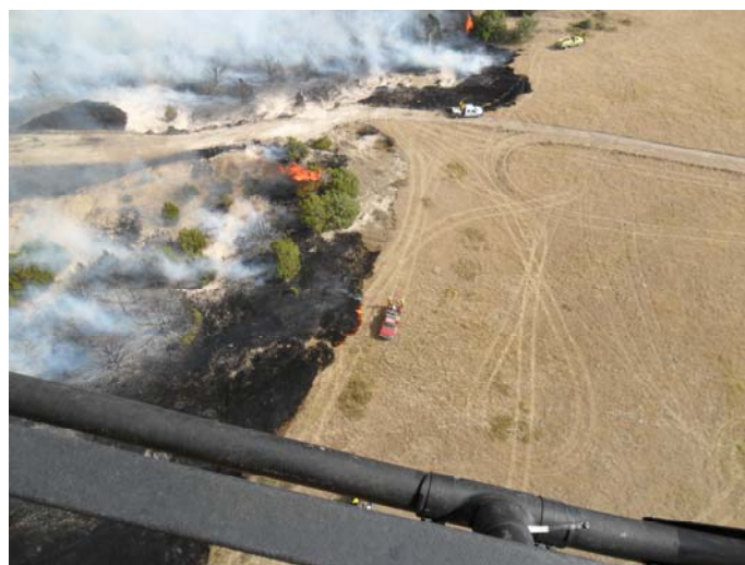
Region 23 Complex Fires in Northwestern Nebraska, 2012.