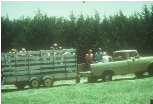
Range Campers on the ranch tour, just a few short years ago.