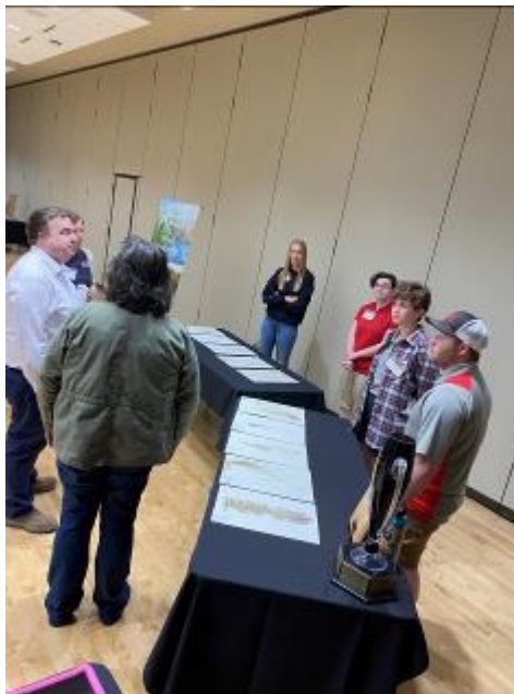
Symposium 3 – Range Club was able to test participants on the URME and Plant ID.