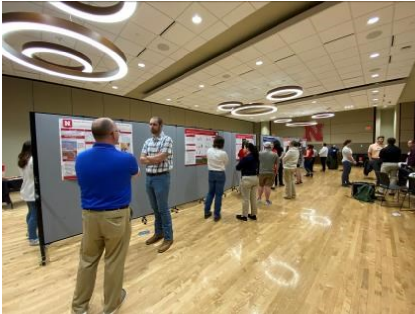
Symposium 1 – Poster session that involved both graduate and undergraduate students from UNL.

The Nebraska Society of Professional Soil Scientists and the Nebraska Section of the SRM came together on April 14 th for a first ever joint Symposium entitled “Healthy Soil. Healthy Range.” The day-long event consisted of speakers from the USDA-NRCS and UNL with topics ranging from patch-burn grazing to soil health in cropping systems. Fourteen graduate and undergraduate students presented their posters, which included our 1 st place Rangeland Cup team poster. Post-lunch the Range Club and Soils Judging Team provided demonstrations of the contests they compete in each year. The Range Club stumped a few participants with a mini URME test.