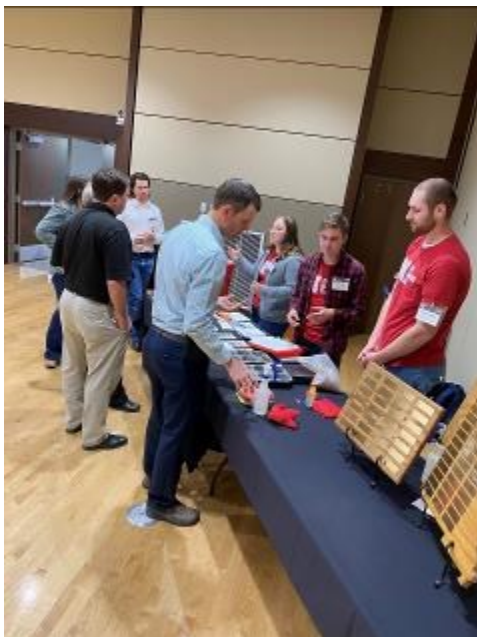
Symposium 2 – Soils Judging Team’s demonstration for participants. They were able to bring by Oklahoma soil for judging.