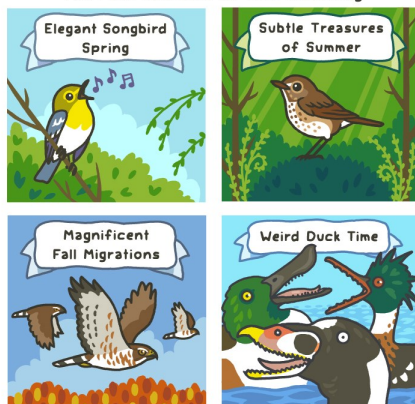
The Four Seasons of Bird Watching